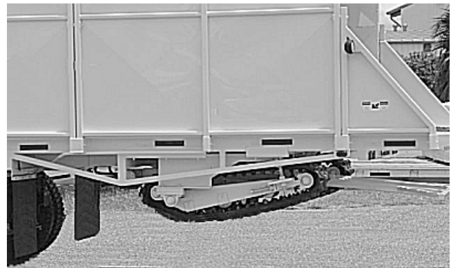
Preferred Module Truck