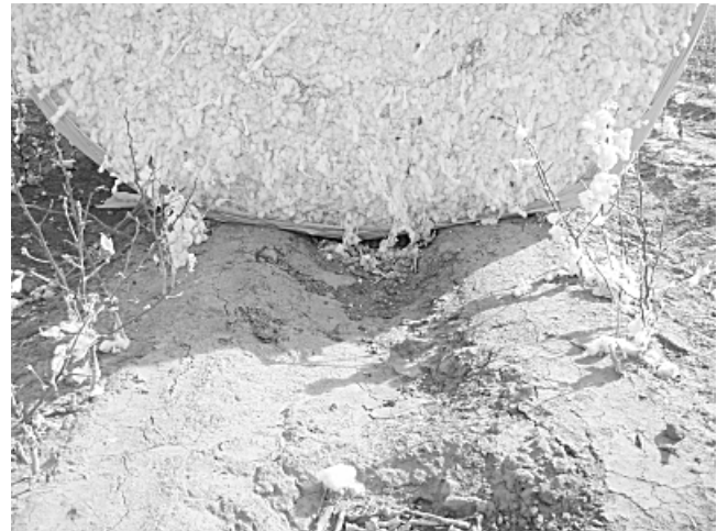
Incorrect Staging Surface Figure A

If at all possible do not stage modules on top of rows or beds or internal portion of field where module truck access will be difficult. Modules will take the shape of the surface they are placed on as shown in (Figure A). Setting on beds or uneven surfaces requires digging into the ground with the module truck chain to safely get under the entire surface of the module.